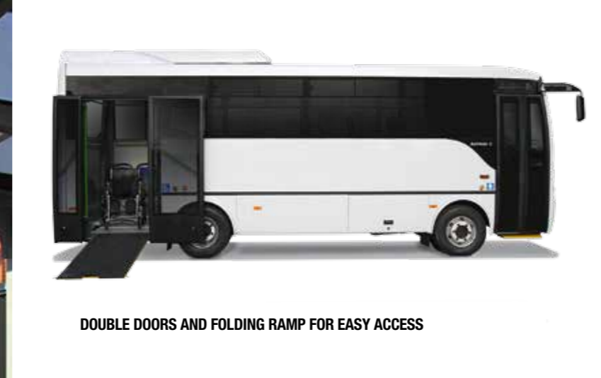
DOUBLE DOORS AND FOLDING RAMP FOR EASY ACCESS