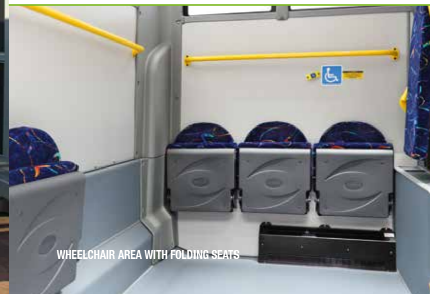
WHEELCHAIR AREA WITH FOLDING SEATS