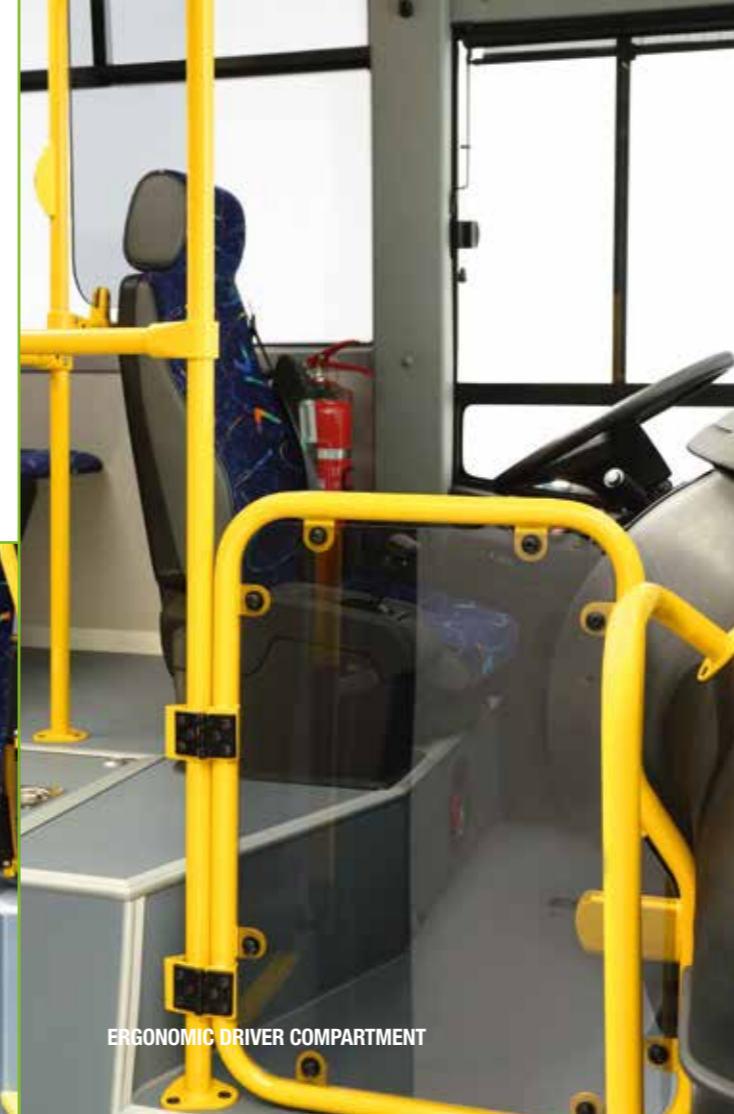
ERGONOMIC DRIVER COMPARTMENT