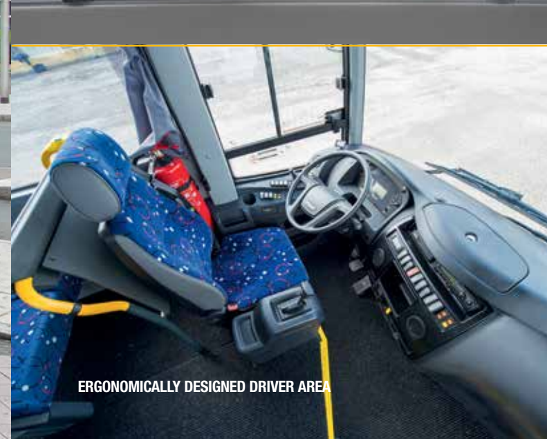
ERGONOMICALLY DESIGNED DRIVER AREA