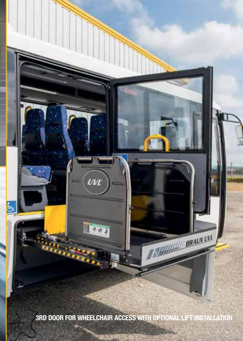
3RD DOOR FOR WHEELCHAIR ACCESS WITH OPTIONAL LIFT INSTALLATION