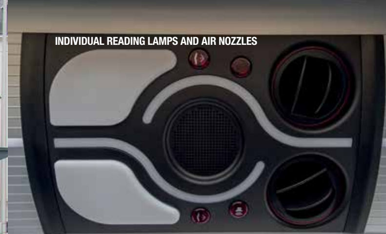
INDIVIDUAL READING LAMPS AND AIR NOZZLES