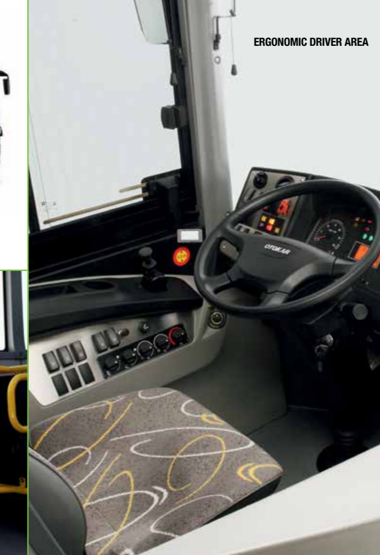
ERGONOMIC DRIVER AREA