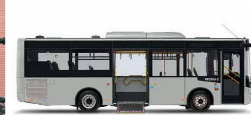
LOW ENTRY, DOUBLE MIDDLE DOOR AND WHEELCHAIR RAMP FOR EASY ACCESS