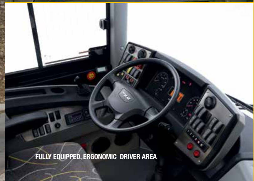
FULLY EQUIPPED, ERGONOMIC DRIVER AREA