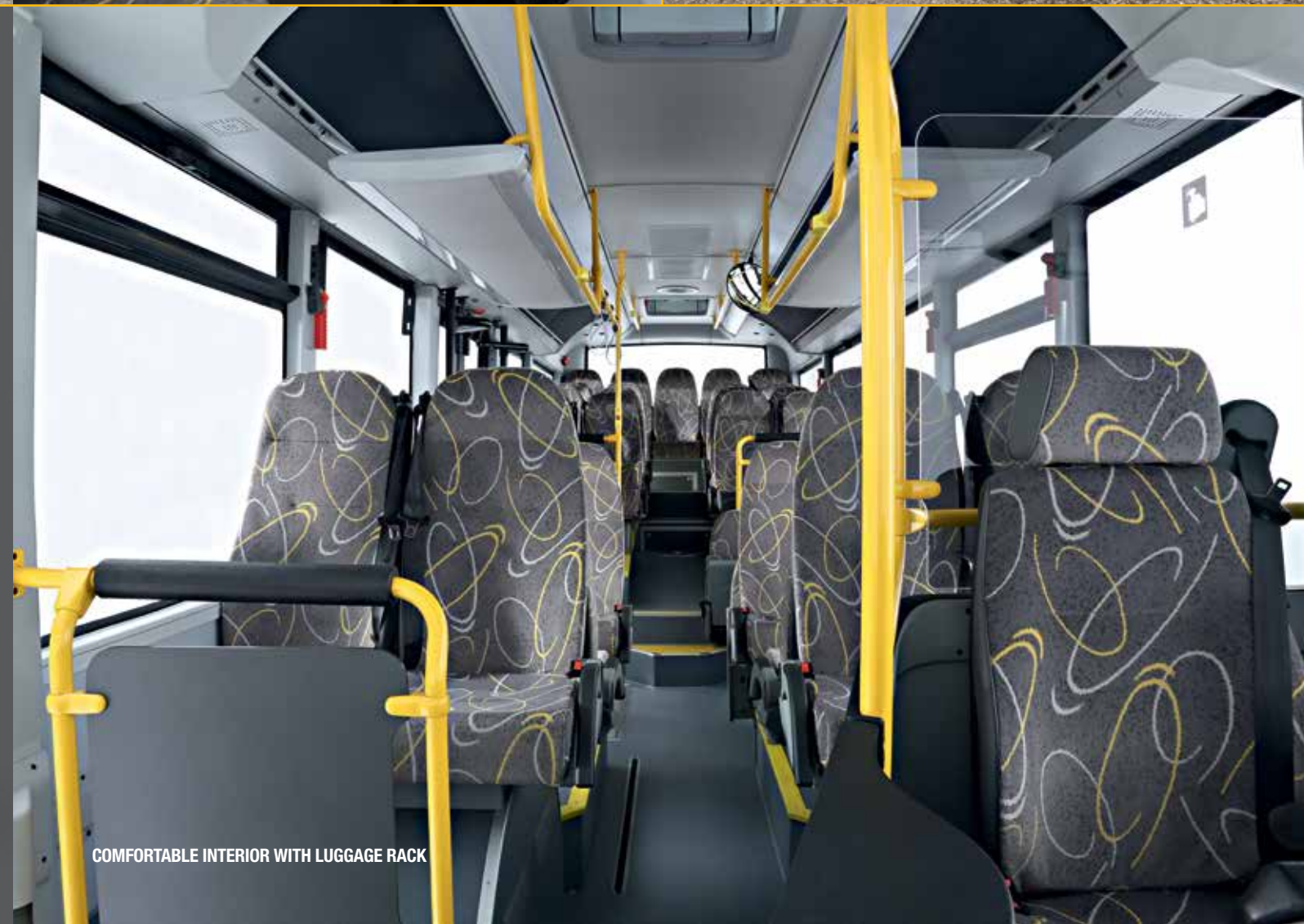
COMFORTABLE INTERIOR WITH LUGGAGE RACK