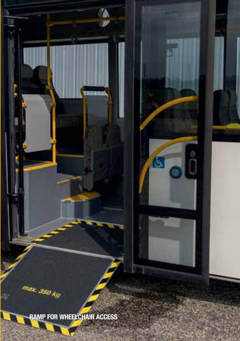
RAMP FOR WHEELCHAIR ACCESS max. 350 kg