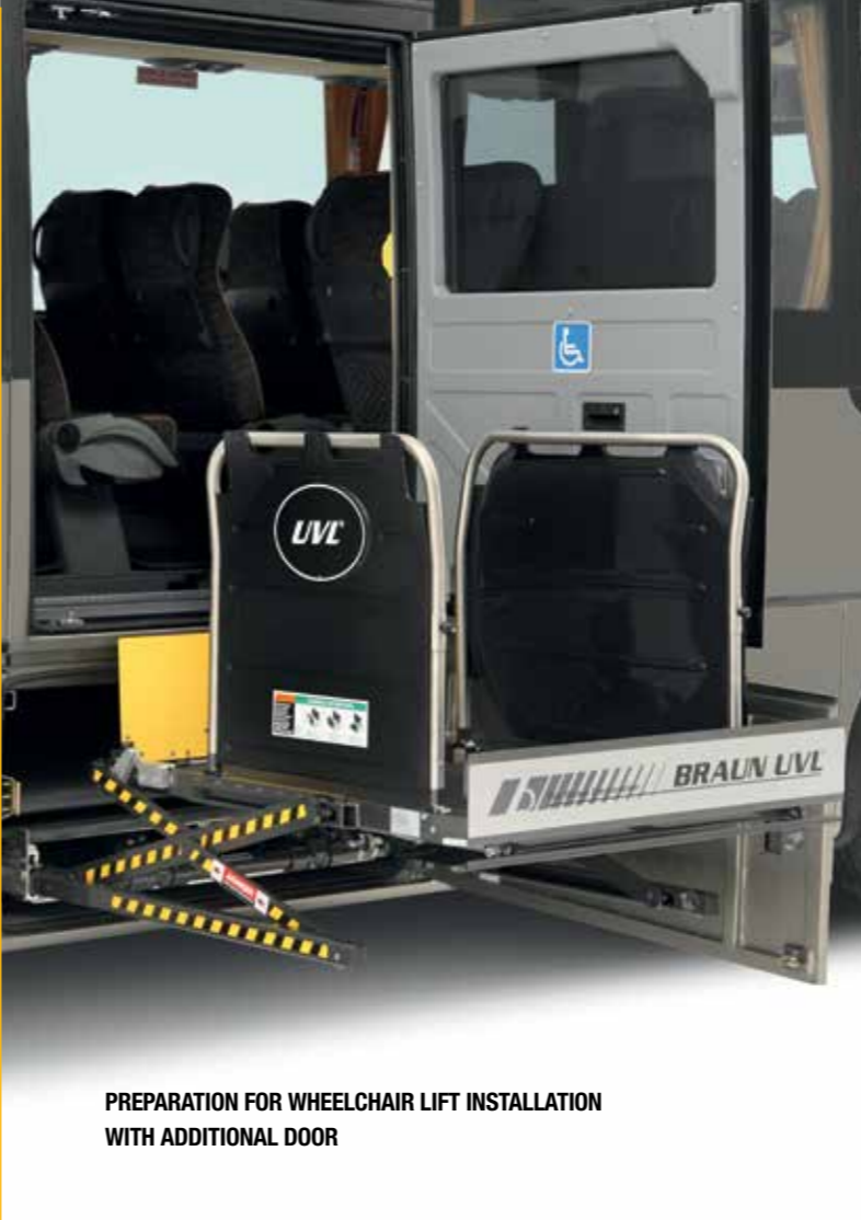
PREPARATION FOR WHEELCHAIR LIFT INSTALLATION WITH ADDITIONAL DOOR