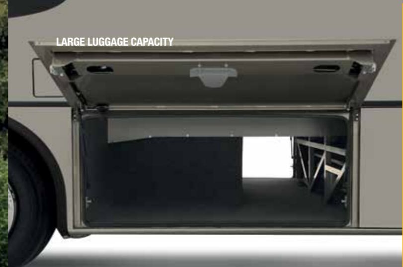
LARGE LUGGAGE CAPACITY