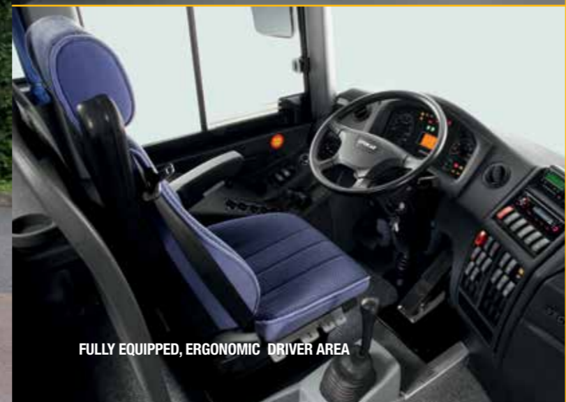
FULLY EQUIPPED, ERGONOMIC DRIVER AREA