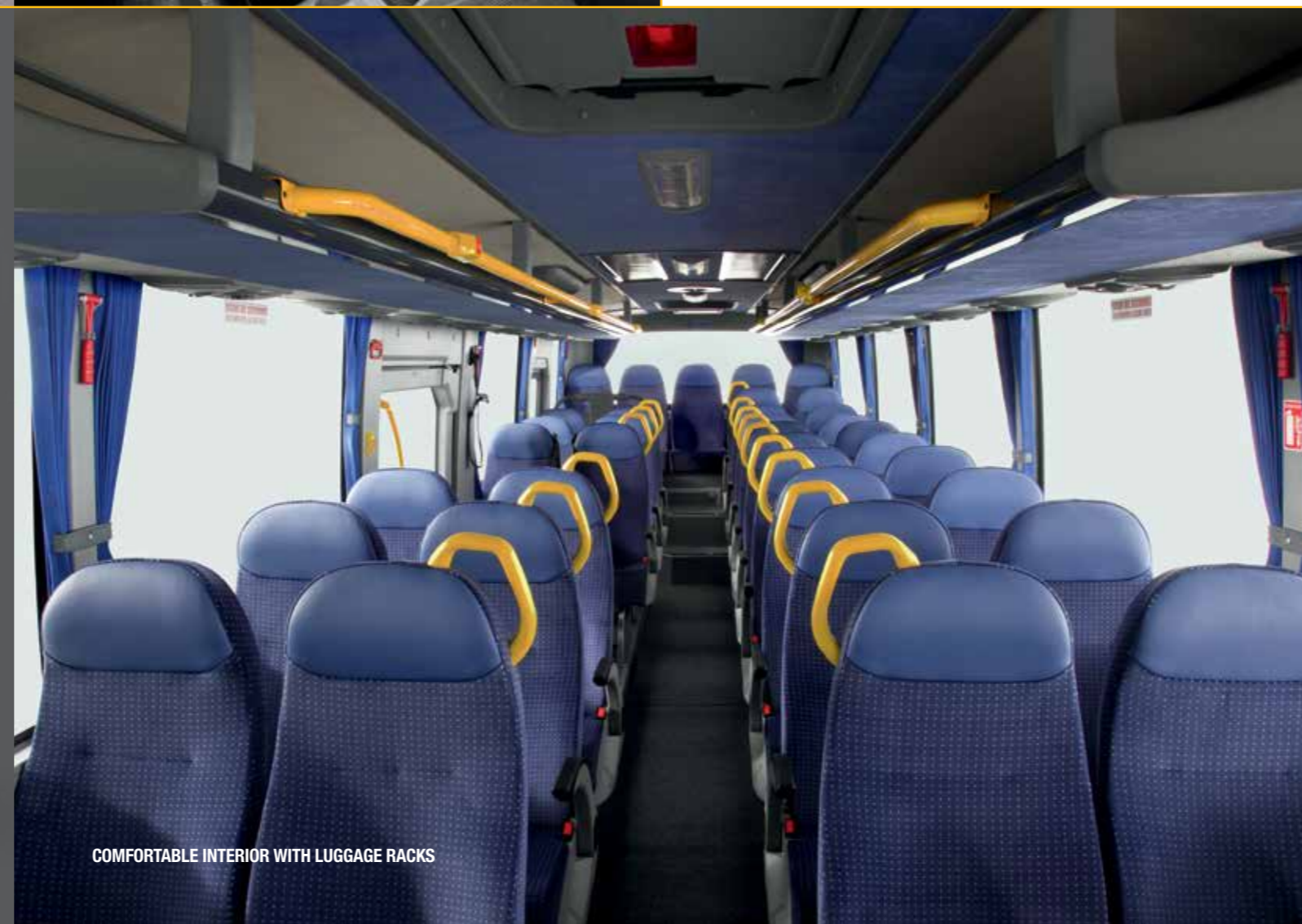
COMFORTABLE INTERIOR WITH LUGGAGE RACKS